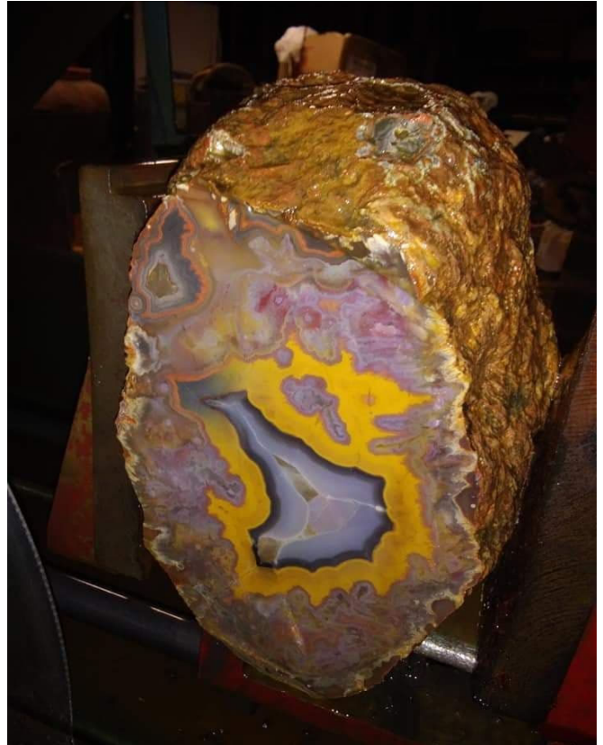
Kentucky Agate: This is what we will be looking for—and hoping to find!

I suggest if you plan to attend, make your accommodations reservations soon. Jim and I have booked the Holiday Inn Express in Richmond, Kentucky, which is approximately 20 miles from Irvine. Jim's contact states that there are limited hotels in the area, and with the additional visitors to the Mushroom Festival, it will be difficult to find rooms. Our contact also states that there are plenty of camping areas, should you choose to go that route.