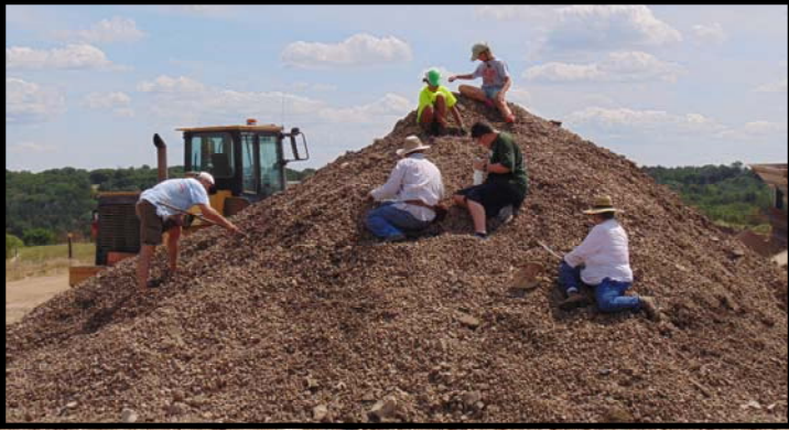
Mineral Monkeys Vienne and Julienne at the top of the pile, while the old timers, including Corey, hunt lower on the pile.

One very nice specimen of petrified wood was discovered by one of the Mineral Monkeys. (Sorry, girls. I still don't know who is who.)